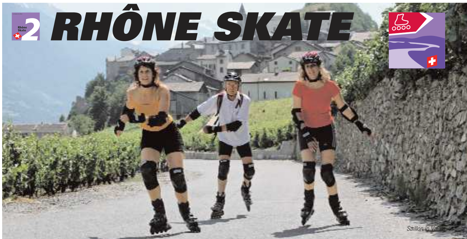
Saillon in Valais