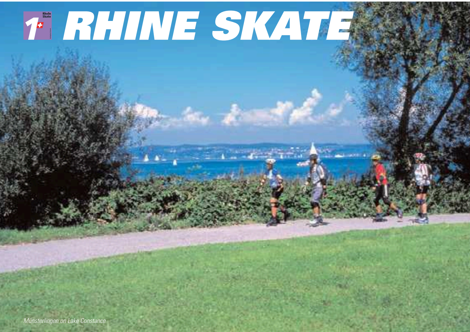
Münsterlingen on Lake Constance