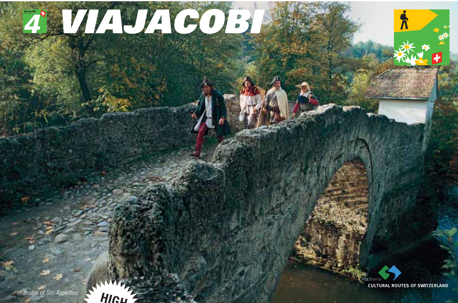
Bridge of Ste-Appolline

ViaStoria CULTURAL ROUTES OF SWITZERLAND