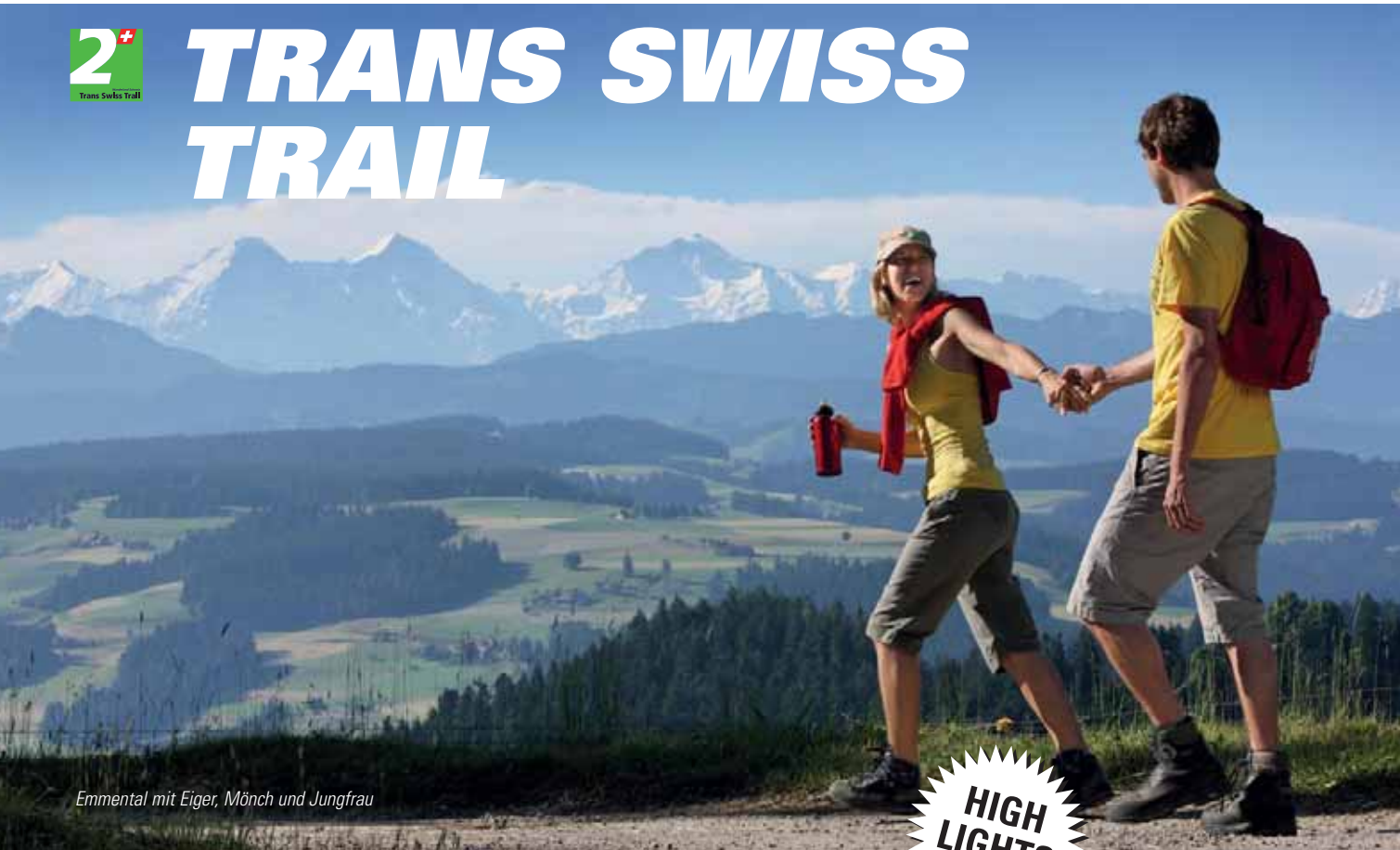
Emmental mit Eiger, Mönch und Jungfrau