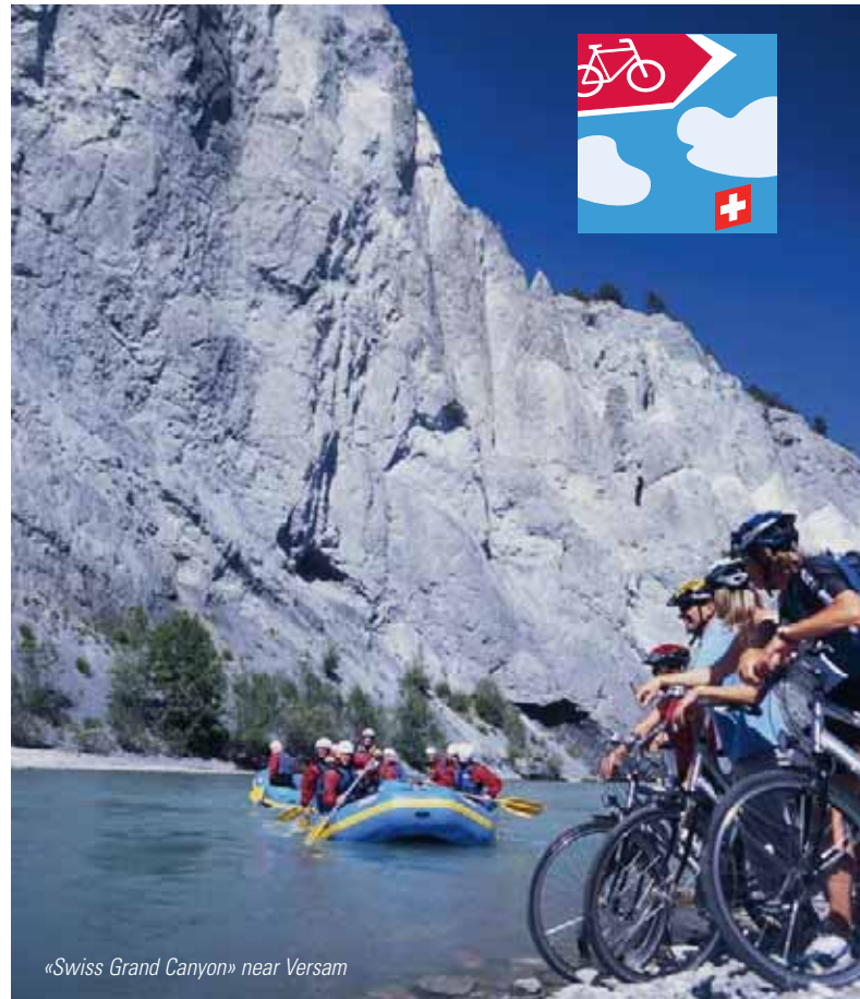
«Swiss Grand Canyon» near Versam