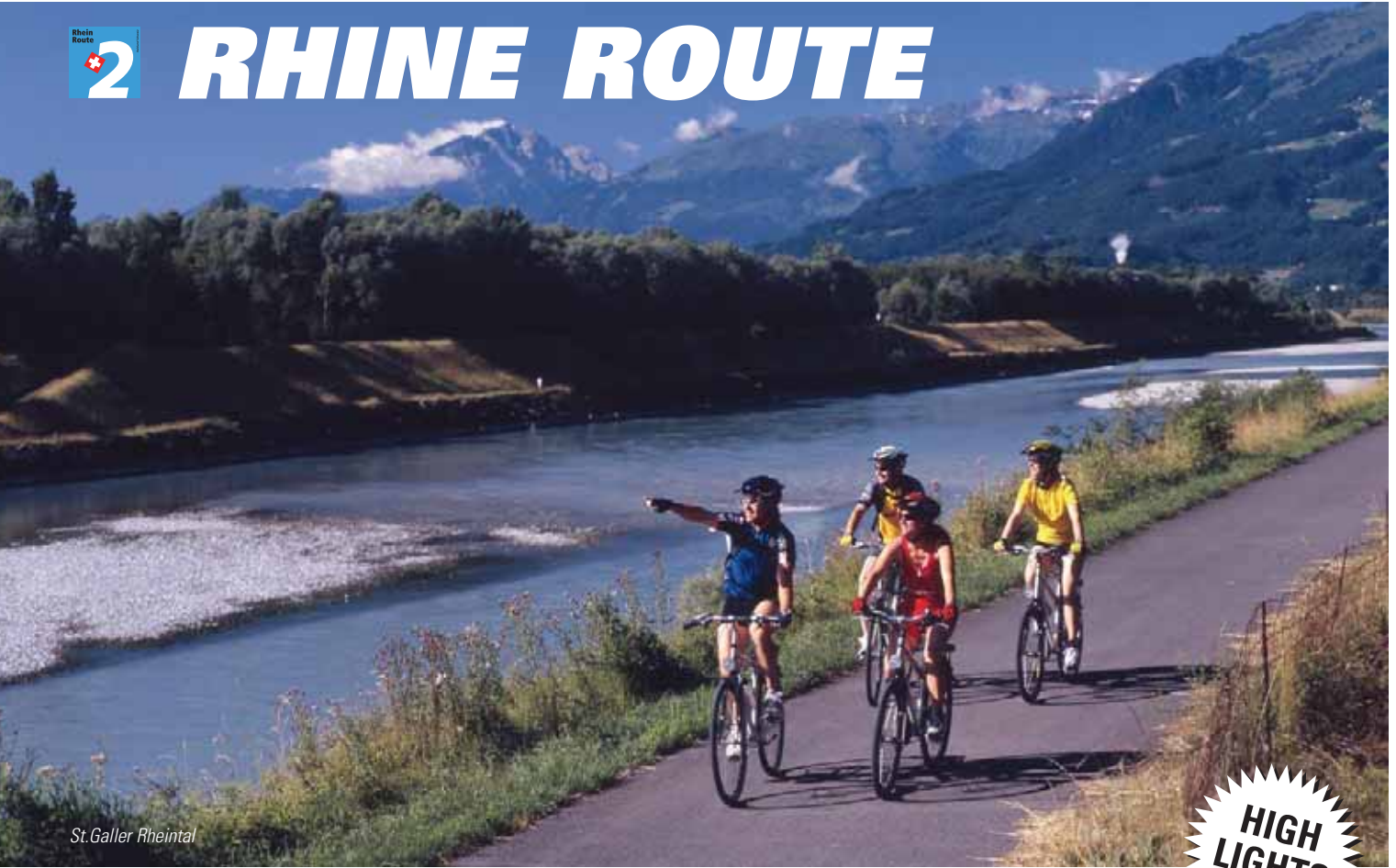
St. Galler Rheintal