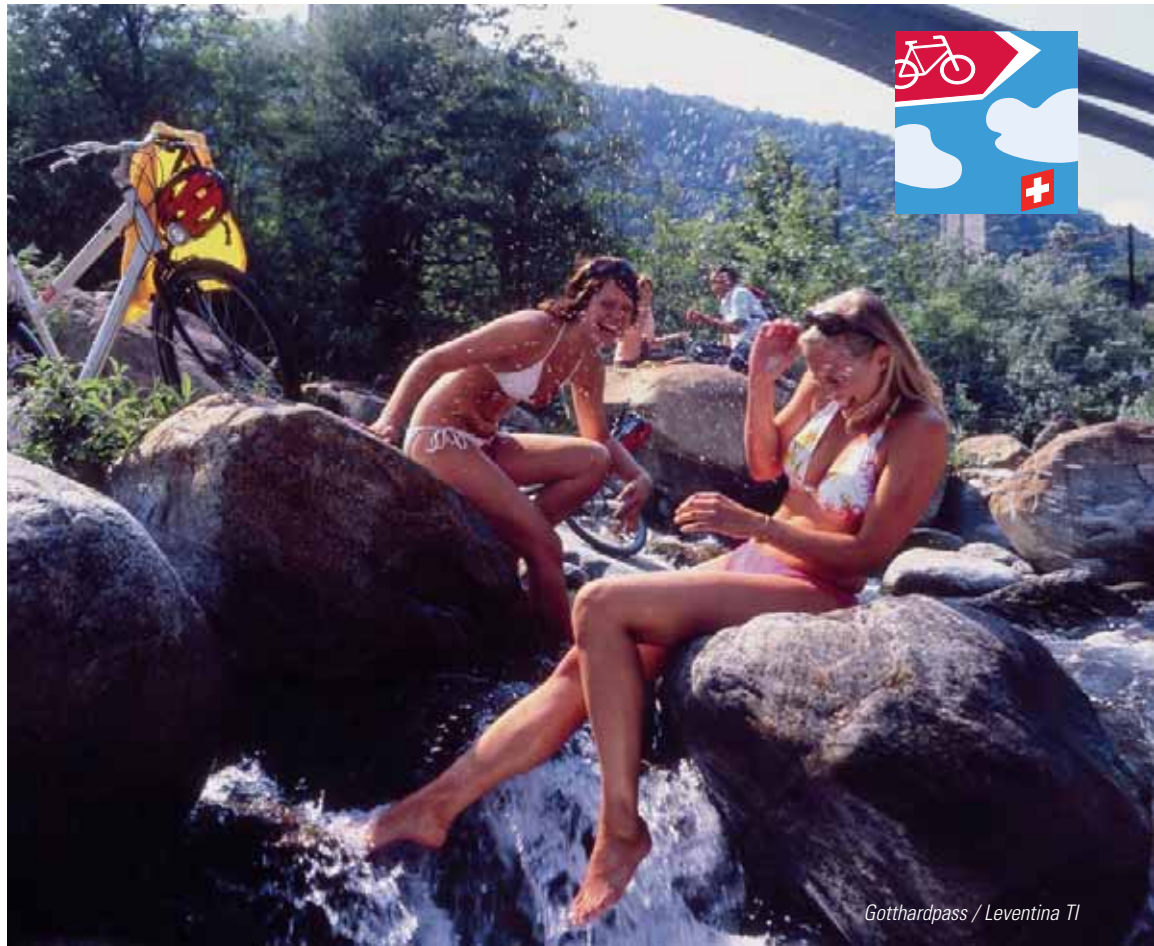
Gotthardpass / Leventina TI

15.04.-15.10.2009 (daily service) Gotthard Pass opens approx. 01.06.