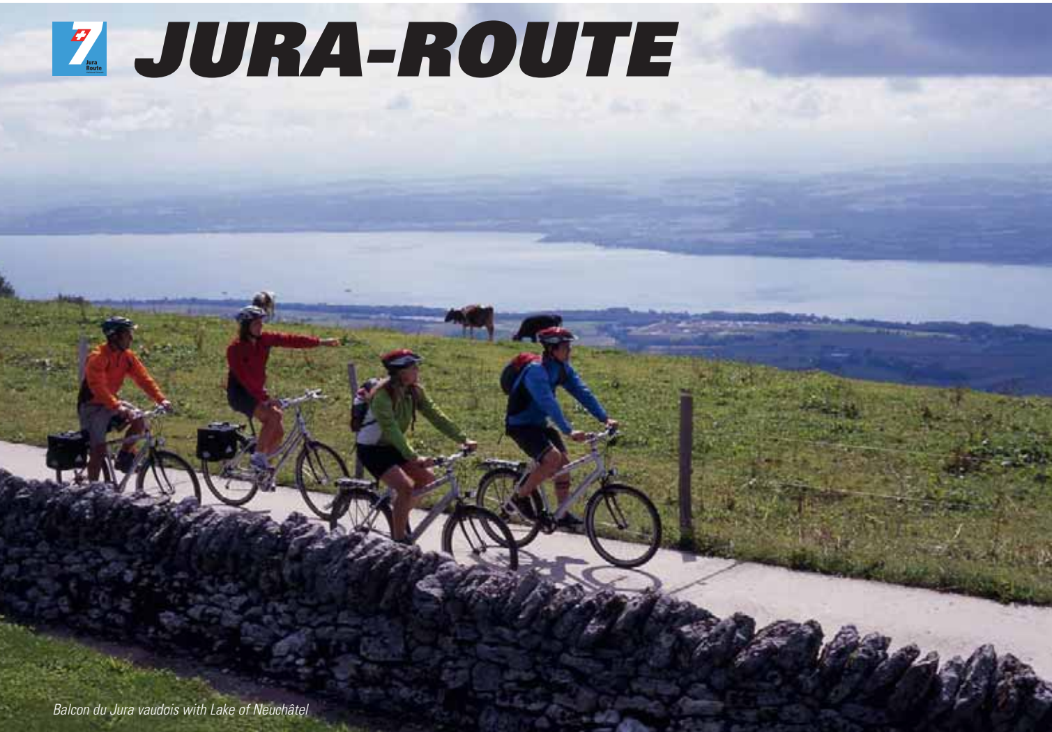
Balcon du Jura vaudois with Lake of Neuchâtel