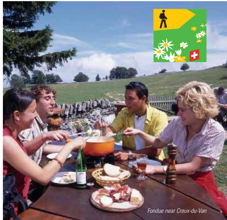
Fondue near Creux-du-Van

The Aiguilles de Baulmes – a bizarre and