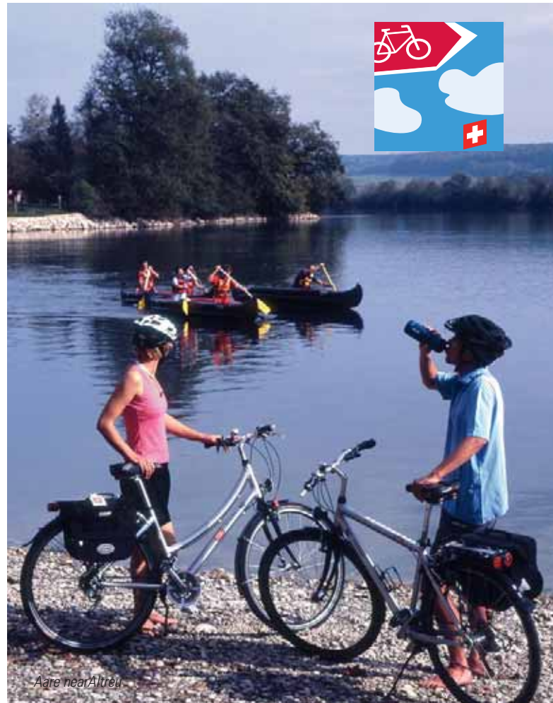
Aare near Altreu