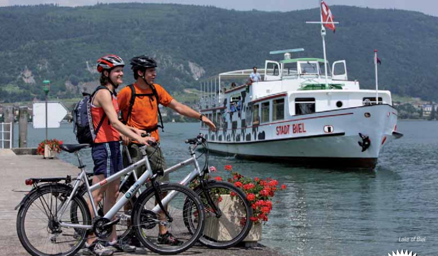
Lake of Biel