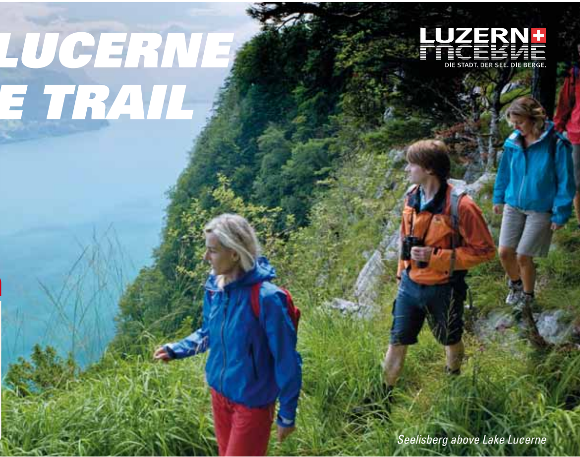
Seelisberg above Lake Lucerne