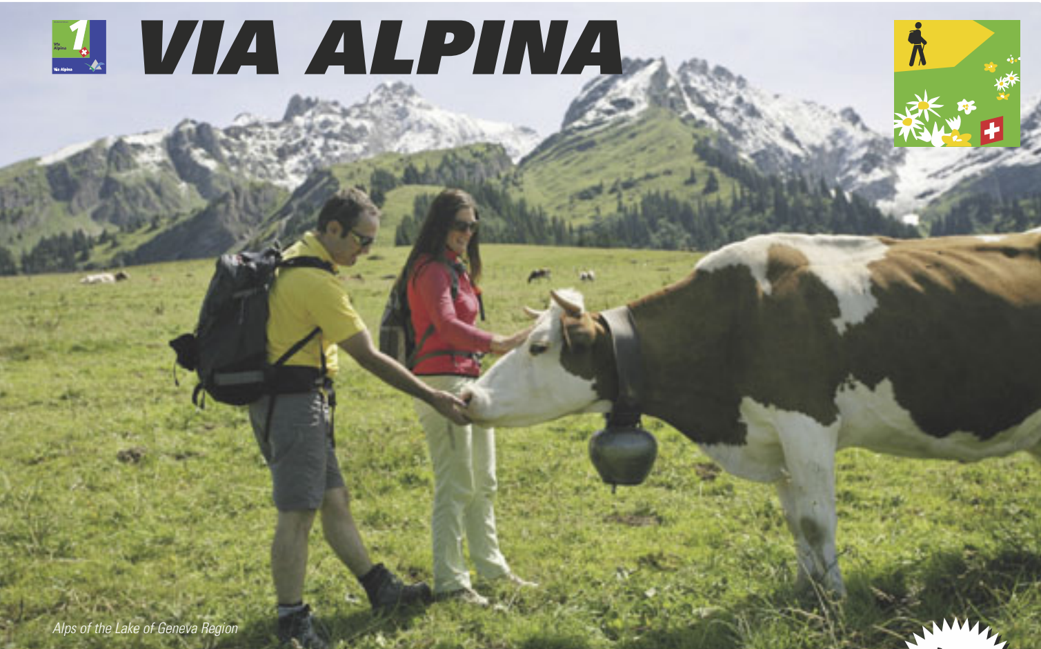
Alps of the Lake of Geneva Region