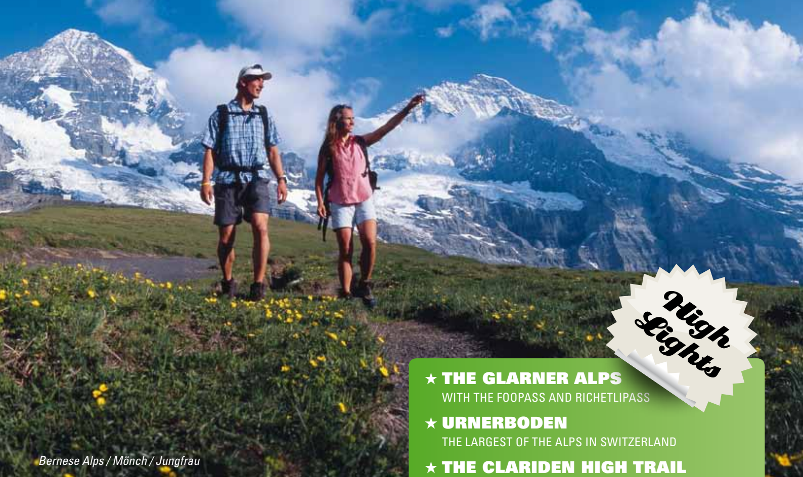
Bernese Alps / Mönch / Jungfrau