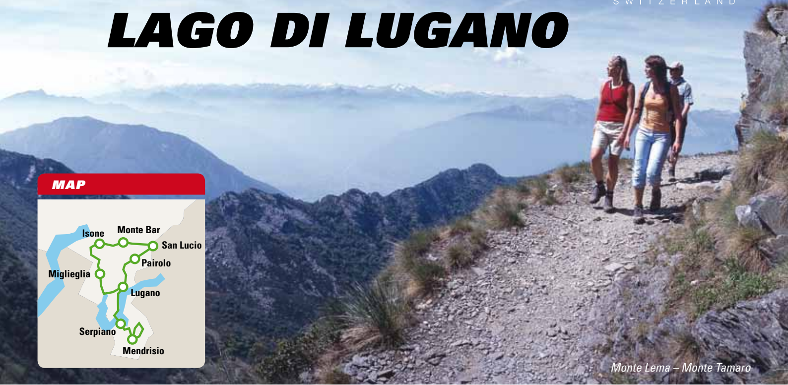
Monte Lema – Monte Tamaro